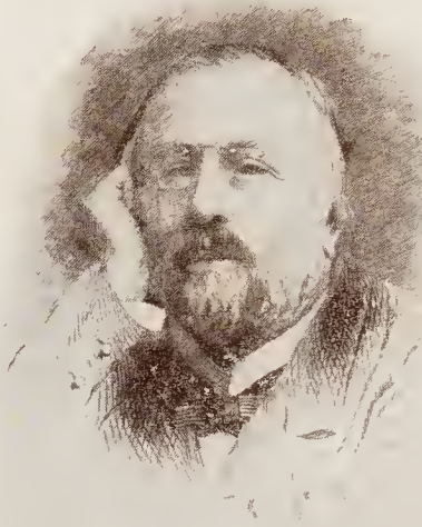
Hippolyte Adolphe Taine From the etching by Asher B. Durand